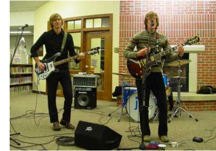
Jet Pack UK rocks the library and lands GADL on You Tube